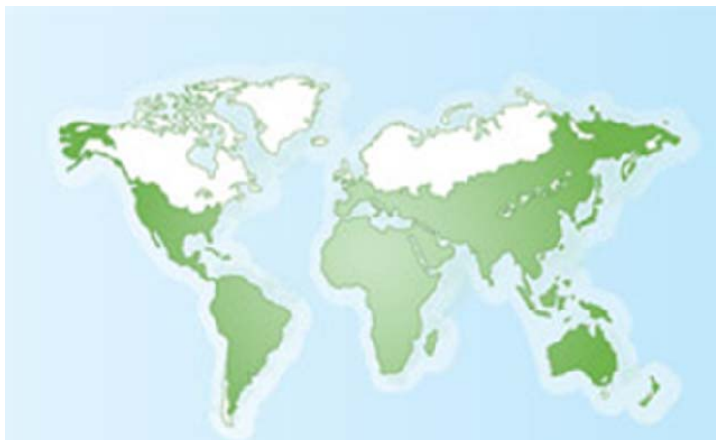
30% of the land was covered at the peak of the ice age

These ice free zones help us explain what happened to the mammoths. The evidence is that these ice free zones were lush in vegetation, supporting large amounts of animals. Towards the end of the ice age, the glaciers were receding, but the Arctic Ocean finally cooled enough to freeze over. The climate changed drastically as glaciers melted and former northern temperate areas got much colder. The animals living in these zones would have been